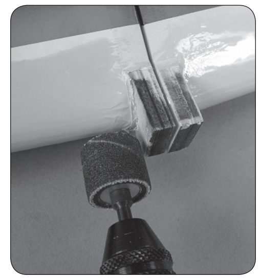
For removal of a small amount of material from the tab sanding is recommended.

If the tabs are too wide for the opening in the former as shown above it will be necessary to remove material from the wider of the two wing tabs.